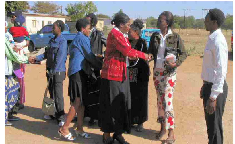
Greeting everyone at the conclusion of worship