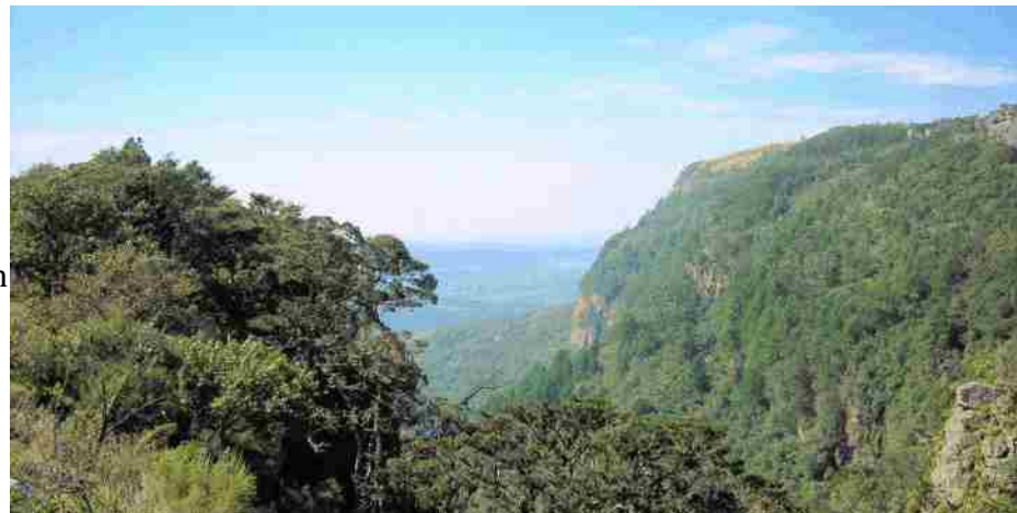
On the high Veldt looking towards the low veldt (east) near the Blyde River canyon, South Africa