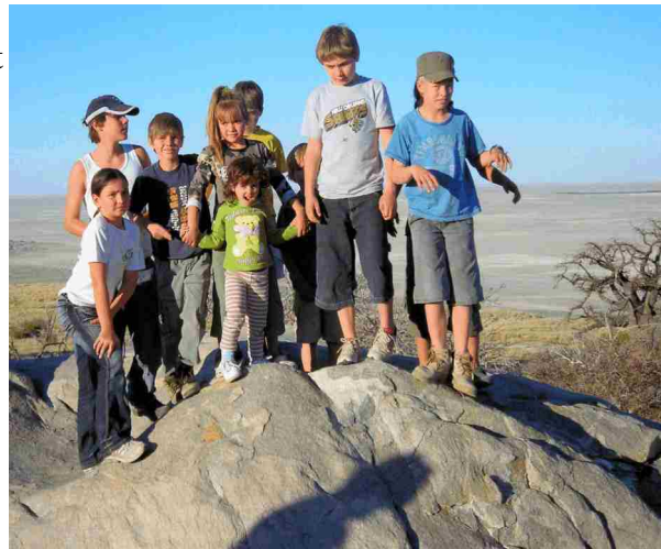
On a rock on an island that is surrounded by the pans. There's no water at this time of year so we camped there one night.