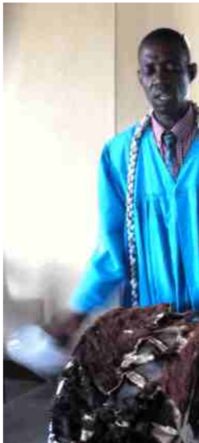
Drumming accompanying singing.