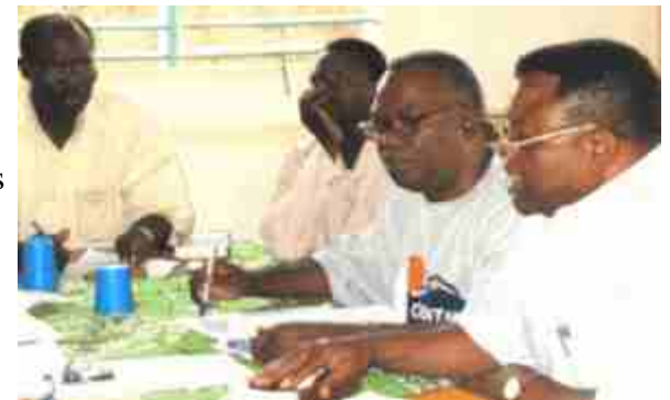
Members of the International Central Council of AIMM from Burkina Faso and Congo.