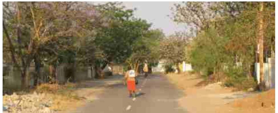
Our street In Gaborone, outside our house, around the world from you.